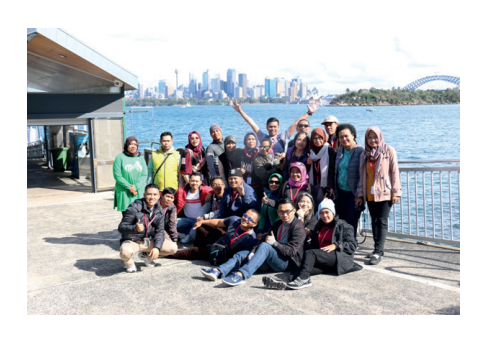
AAI Group 2 enjoying the Australian sites at Taronga Zoo in Sydney.

contact screening and management project manager, have been collaborating with a STA project team to implement their "puzzle" health promotion tool in Timika. In addition, a number of AAI participants from other Papuan districts have visited Timika to learn about the TB preventive therapy program being implemented there. This is another example of promising collaboration forged from the networking amongst Indonesian participants, Indonesian health professionals and Australian organisations through the courses.