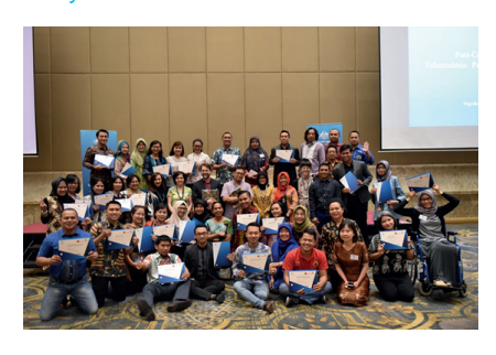
Official completion of the post-course program in Yogyakarta.

"Very impressed with the comprehensive program arrangement, great facilitators, punctuality, amazing experts, appreciation for both individuals and group, healthy lifestyle of Australians ... felt like a dream."